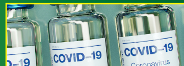
Facts about the Vaccine P10