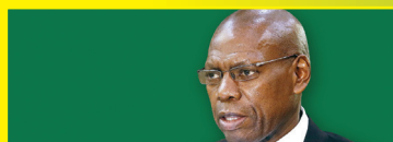
Message from Minister P2