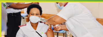
Health Worker Testimony P4