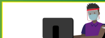
How do I register to get Vaccinated P5